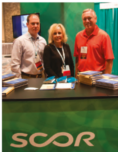
The SCOR Global team at the AHOU Expo.