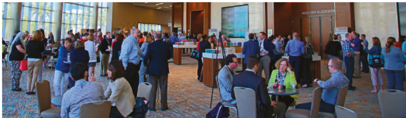
The AHOU Conference provided many networking opportunities.