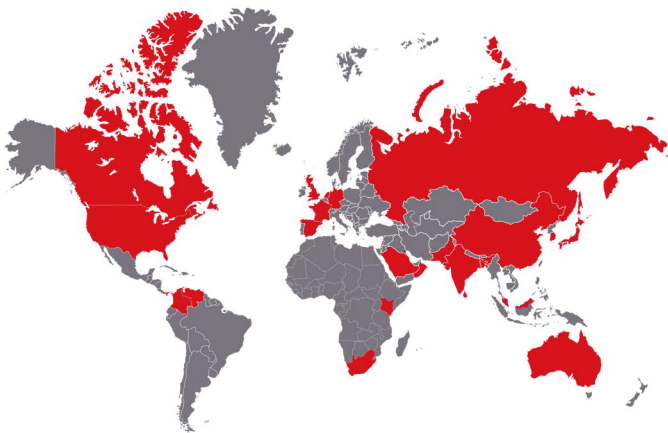
Figure 1: Map of Candida auris cases worldwide (areas of spread in red)

As for spread, single and multiple incidence of C. auris cases have been reported in more than 30 countries (see Figure 1). At the end of 2019, the U.S. alone had nearly 1,000 confirmed cases in 16 states, the majority of which were in New York, New Jersey, and Illinois. Some of these cases were found in individuals who had recently spent time in healthcare facilities in India, Kenya, Kuwait, Pakistan, South Africa, the United Arab Emirates, and Venezuela. 12